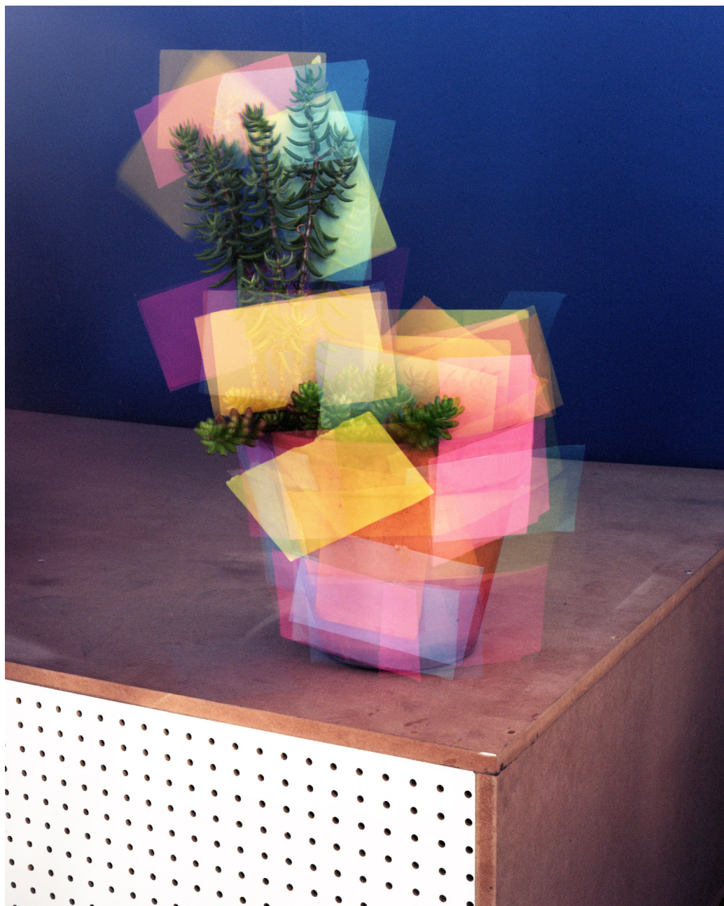
Glassell Park #4 Archival inkjet print, ed 5 79" x 64"